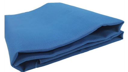
#18 - without stretch