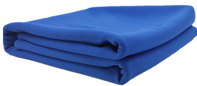
#11 - with stretch

* Standard Accessories For Fusing Machines And Iron Tables. * Mainly used on ironing tables and presses as final covers.