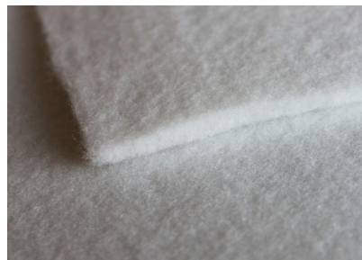
P 802 Felt