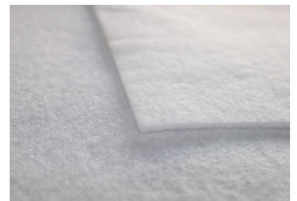
Non Woven Felt