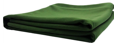
#12 - with stretch