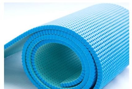
27-33 shore A (hard)