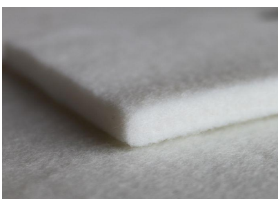
P 902 Felt

Mainly used to spread the steam equally and to protect the clothing from spots caused by uneven steam distribution.